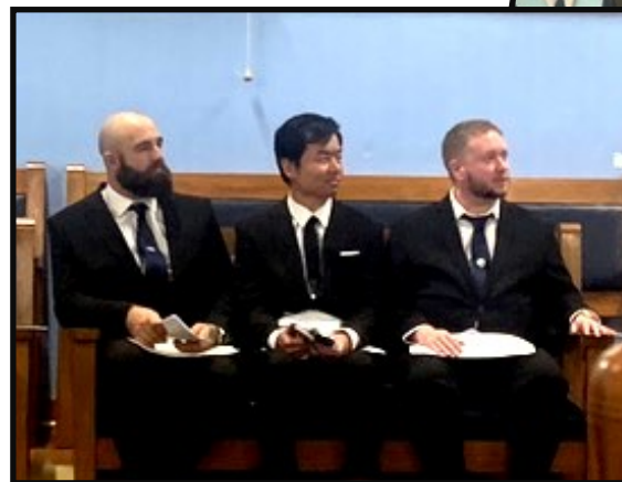
The future of Lodge Waikato